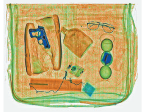
RealClear® reveals components of a gun, knife and bomb in real time, without lags and delays.