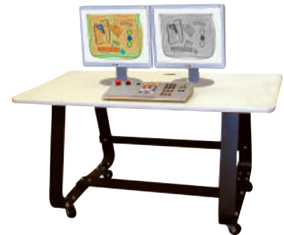
Available operator table and dual or LCD monitors (one 17" CRT is the normal configuration).

Control Screening is the leading worldwide producer of fast, reliable and sophisticated X-ray, Metal and Trace Detection screening systems. Visit us at www.controlscreening.com . Ask about our mobile and cargo systems. Our advanced systems and options are often integrated, leased or rented.