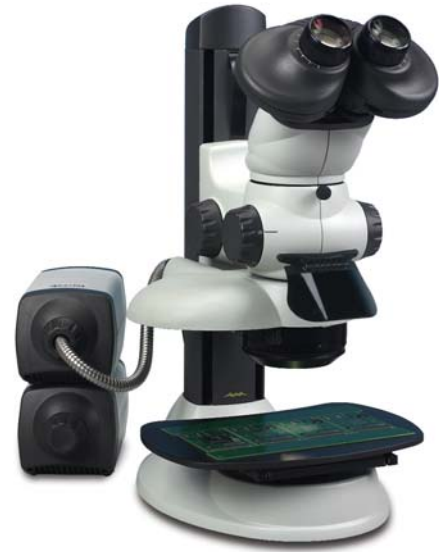
Alpha bench stand with optional oblique and direct viewer.