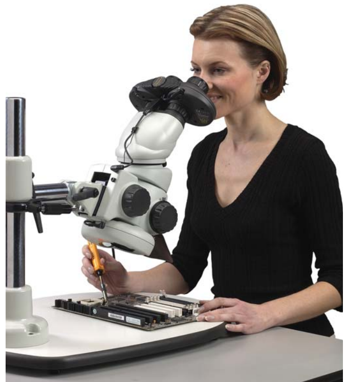
Alpha boom mount with optional fixed angle viewer.

Crank handle option allows convenient vertical adjustment when frequent changes in working distance are required.