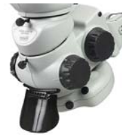
Fixed angle viewer