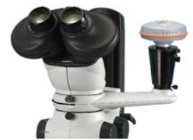
Image capture and archive