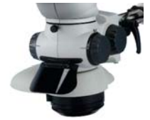
Oblique and direct viewer