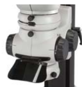
Step magnification multiplier