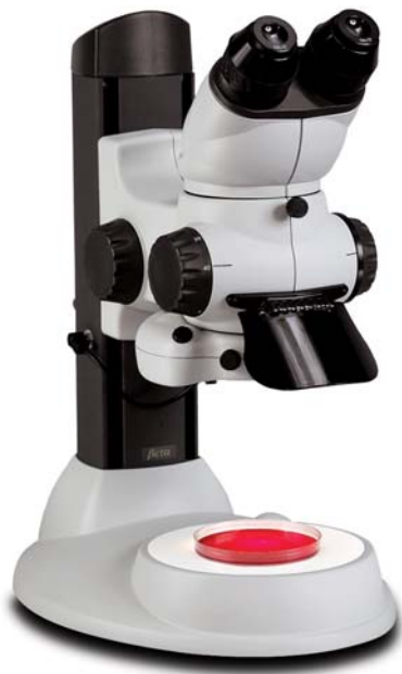
Beta, high quality viewing for biomedical applications.