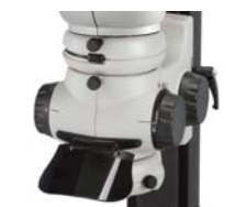
Step magnification multiplier