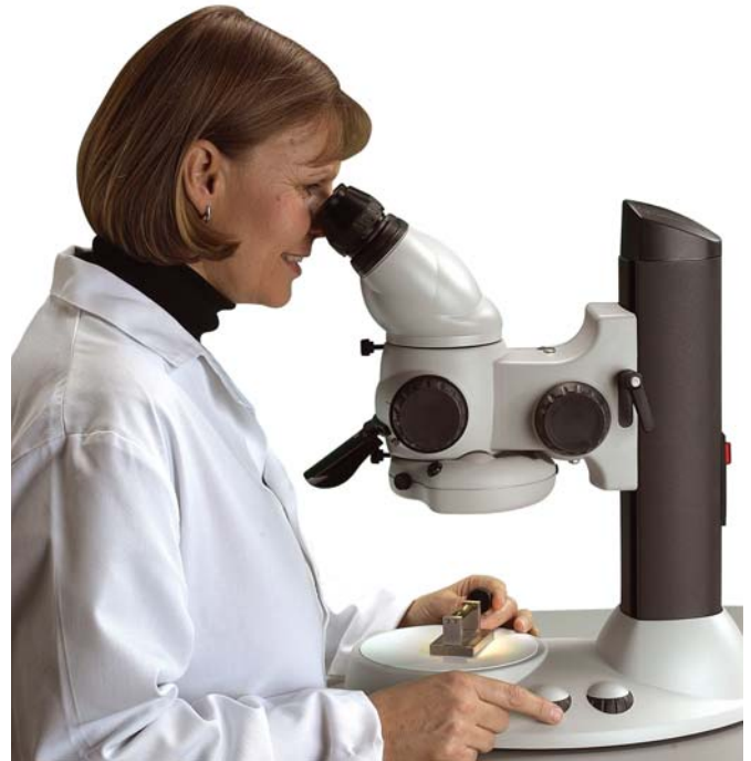
Beta bench stand with integral substage illumination.