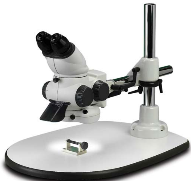
Beta, with swing away boom mount, for flexibility and ease of use.

Crank handle option allows convenient vertical adjustment when frequent changes in working distance are required.