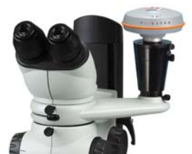
Image capture and archive