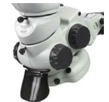
Fixed angle viewer