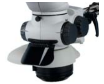
Oblique and direct viewer