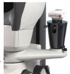
Image capture and archive