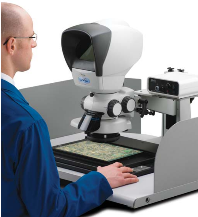
Oblique and direct viewer allows a 34° from vertical view, which can be rotated through 360° for superb stereo view of 3-dimensional subjects.

Lynx VS8 is a variant of Vision Engineering's Lynx stereo microscope. Lynx utilises Vision Engineering's patented Dynascope™ technology to offer the user advanced ergonomics by removing the need for restrictive eyepieces. Lynx VS8 is in use in tens of thousands of PCB manufacturing sites worldwide and provides optimum ergonomics to reduce fatigue, increase operator accuracy and reduce scrap.