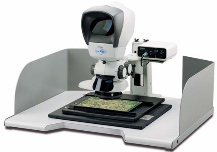
Lynx VS8 with patented eyepieceless optics for specialist PCB inspection.