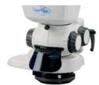
Oblique and direct viewer